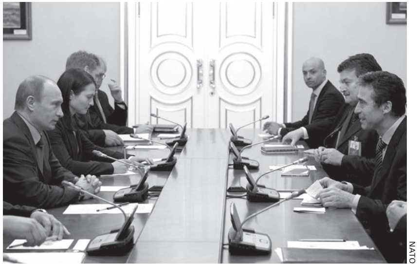
NATO Secretary General Anders Fogh Rasmussen meets with Russian Prime Minister Vladimir Putin, Moscow, December 2009.

Even though Russia was present at the 2010 NATO Summit in Lisbon and cooperative agreements made on missile defense and other issues, this adversarial approach was evident when decision-makers made any further draw-downs in the deployment of nuclear weapons conditional upon reciprocal measures from Russia. This occurred despite the fact that the most significant, and possibly only credible reason for retaining tactical nuclear weapons in Europe is