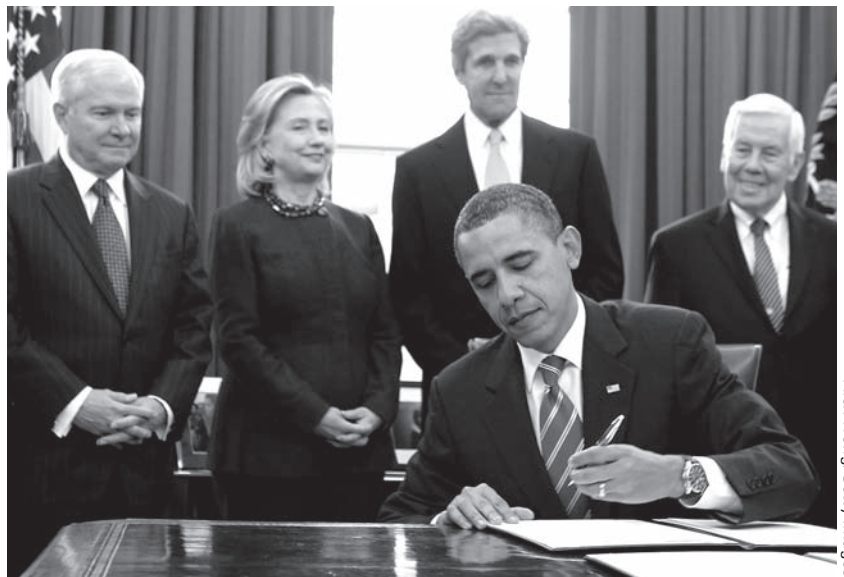
U.S. President Barack Obama signs the New START Treaty into law as (L-R) Secretary of Defense Robert Gates, Secretary of State Hillary Clinton, Sen. John Kerry (D-MA), and Sen. Richard Lugar (R-IN) look on during an Oval Office ceremony February 2, 2011 in Washington, D.C.

When President Obama signed the New START Treaty, he stated that there should be follow-on negotiations that would also address reductions in nonstrategic and nondeployed strategic nuclear