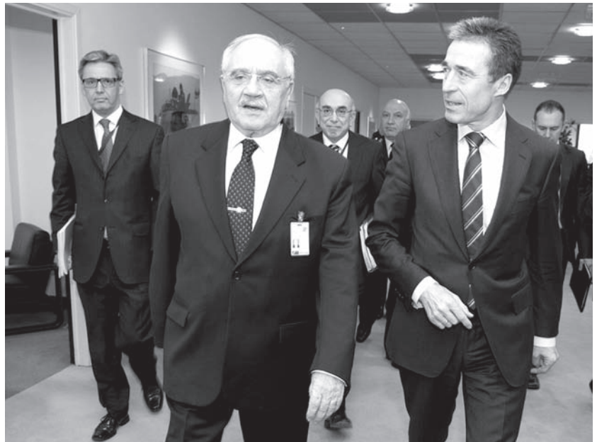
Turkish Defense Minister Mehmet Vecdi Gönül (L) and NATO Secretary General Anders Fogh Rasmussen at NATO Headquarters in Brussels, March 2011.

This all ensured that politicians focused upon issues that were related to the most immediate concerns of the ruling elite, such as strengthening the economy and maintaining order in the country. Strategic matters, such as the hosting of U.S. nuclear missiles (Jupiters) or the atomic bombs stationed in several bases all over Turkey, were left to the military and maybe a handful of civilian experts who had no desire whatsoever to discuss these issues publicly, for fear of losing control. Despite Turkey's transformation into a stable democratic, open, and transparent society, politicians, diplomats and, more so, the military with few exceptions, are