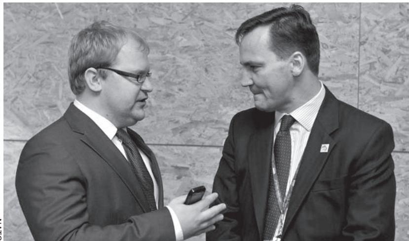
Urmas Paet, Minister of Foreign Affairs of Estonia (L) and Radosław Sikorski, Minister of Foreign Affairs of Poland (R), NATO Summit, November 2010. In a February 1, 2010 op-ed, Sikorski and Swedish Foreign Minister Carl Bildt called for “early progress on steep reductions in sub-strategic nuclear weapons.”

The rest of the countries of the region—the Czech Republic, Hungary, and Slovakia—belong to the group of “Article 5 supporters” in NATO and therefore have remained wary of the fast-tracking of any unilateral decisions by NATO on the nuclear issue. However, their official attitude toward Russia has been less emotional and less cautious than that of the countries in the northern part of Central Europe. Consequently, the arguments about the deterrence value of U.S. substrategic nuclear weapons had not been as important for them as the arguments connected with