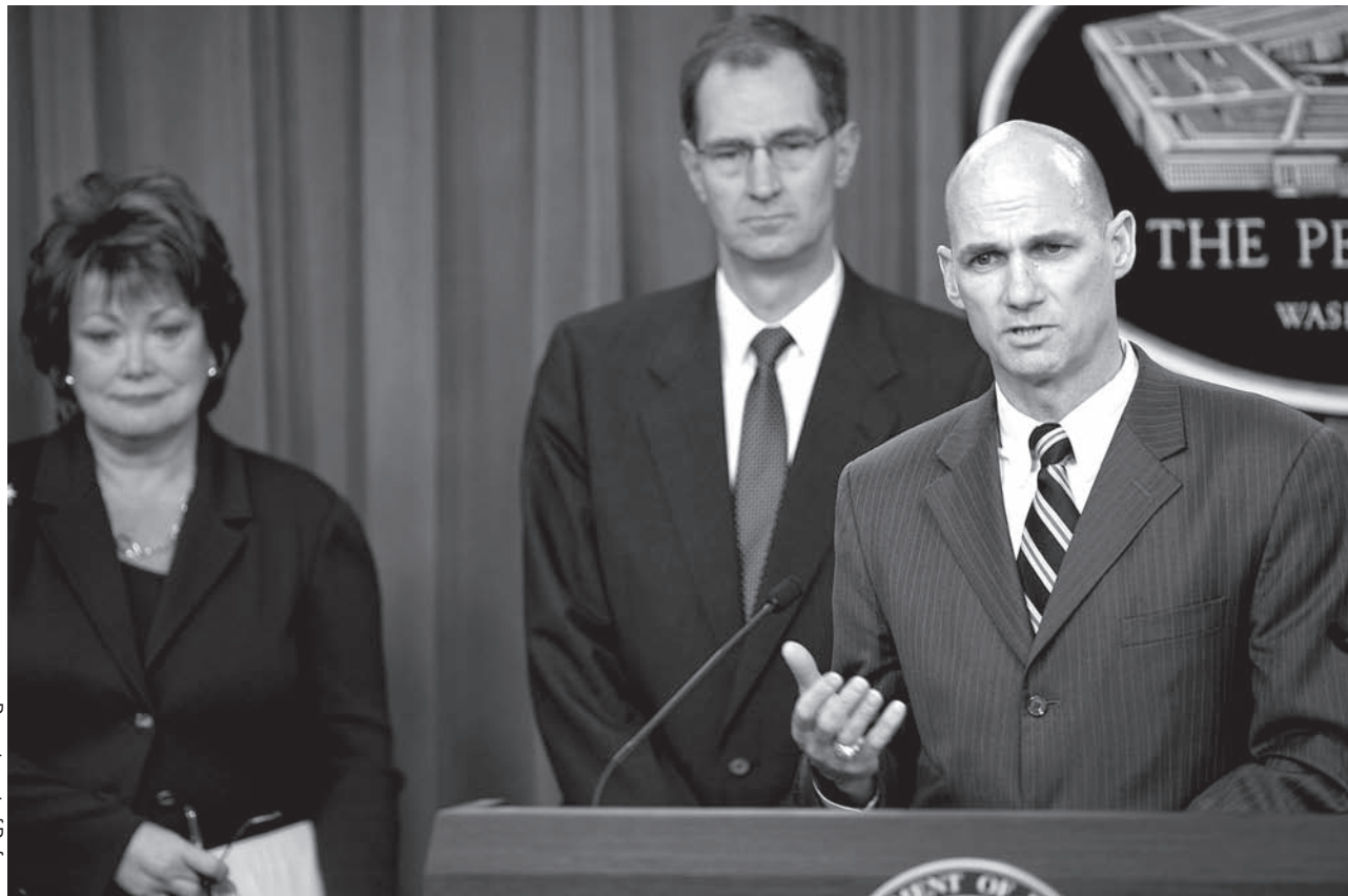
Department of Defense

As the 2010 U.S. Nuclear Posture Review stated, the United States would like to reduce the role of nuclear weapons. The fact that the rationale for the nuclear weapons deployed forward in Europe is entirely, or almost entirely, political would appear to allow room for reductions. U.S. officials believe the Tallinn principles could even accommodate an outcome in which all U.S. nuclear weapons were removed from Europe, though this would be very condition-dependent. (In such a case, allies might share risks and responsibilities by basing U.S. dual-capable aircraft on their ter-