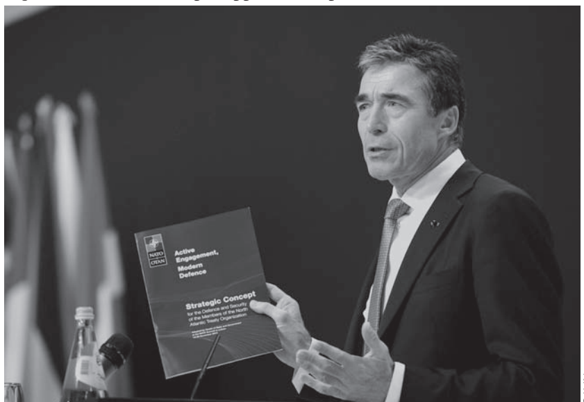
NATO Secretary General Anders Fogh Rasmussen presents the NATO Strategic Concept to the media, Nov. 19, 2010.

The support of Central European allies for making territorial missile defense a NATO mission can also be treated as a means for strengthening the collective defense function of the alliance. Countries of Central Europe supported the previous U.S. administration’s