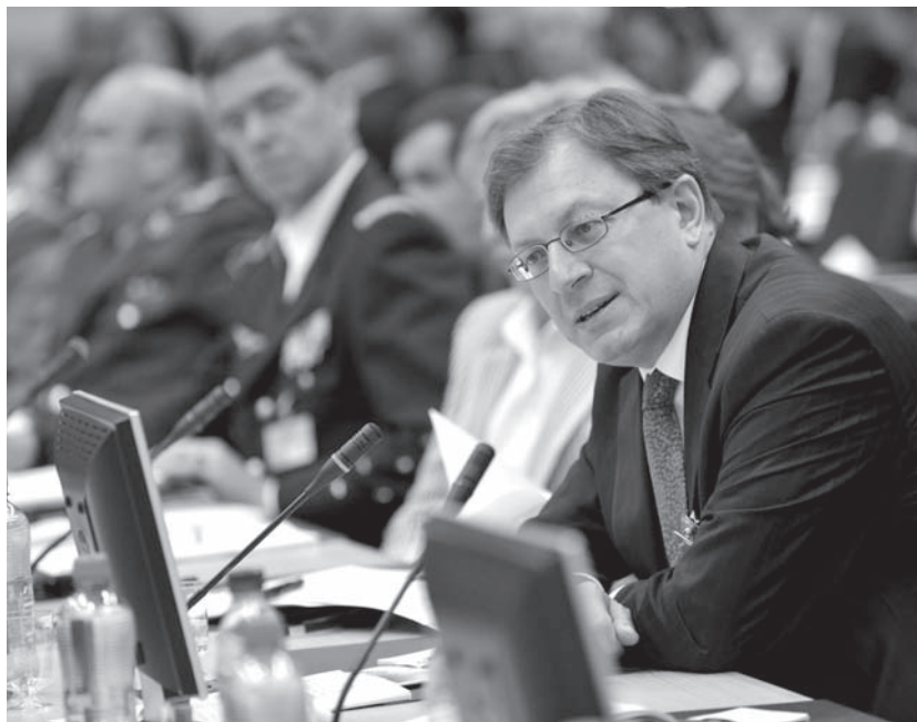
Tacan Ildem, Permanent Representative to NATO for Turkey, July 2009.

While there are regular exercises that practice the delivery of NATO’s nuclear weapons, there is a widespread belief that they have no significant military value as there is no feasible scenario within which the necessary agreement would be reached to use these weapons. This is particularly so in the case of Turkey’s politics. Before and during the November 2010 summit to consider the new Strategic Concept, there was a heated debate over missile defense and whether Iran would