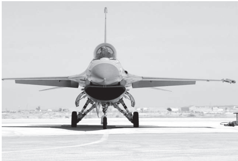
Department of Defense

“Nuclear weapons continue to preserve their critical importance for the security of the [North Atlantic] alliance, yet they are regarded more as political weapons. Our country is committed to the vision of a world free of nuclear weapons, and thus we support every effort in that direction. ... Nevertheless, it must be acknowledged that attaining such a goal will not be possible any