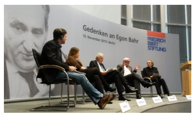
Memorial ceremony for Egon Bahr with Foreign Minister Frank-Walter Steinmeier (Second from right)