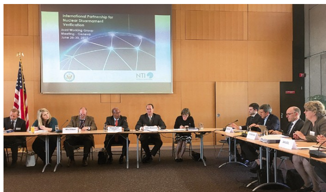
US Ambassador, Robert Wood, greets the participants of the IPNDV Workshops in the Permanent Mission of the USA in Geneva

IPNDV stands for the “International Partnership for Nuclear Disarmament Verification”. The initiative was suggested by the U.S. State Department to explore more closely the verification technologies and tools for the disarmament of nuclear warheads. So far, 25 countries are taking part in it, among them the P5, the five nuclear weapons countries (USA, Russia, China, France and Great Britain). The IPNDV initiative is the only the continuously meeting disarmament forum in which questions of nuclear disarmament are still being constructively worked on. A multilateral destruction of nuclear warheads under the observation of non-nuclear weapons states has, up to now, never been carried out. For this purpose, new inspections, protocols and technologies must be developed and tested.