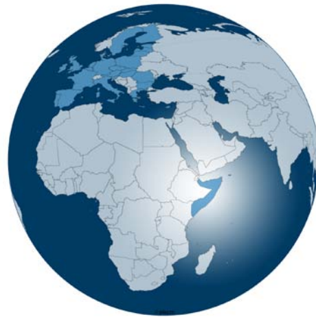
Hot spot Somalia

As a "failed state" and a stronghold of pirates endangering international trade routes, Somalia demonstrates like a textbook example that dealing effectively with today's transnational threats demands strong international cooperation. While the political process on tackling the Somali crisis has been staggering on for years without much of the world's attention, Somali piracy has resulted in unprecedented activities of a multitude of international actors.