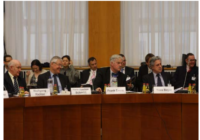
A group of participants at the IDEAS Workshop

U.S.-Russian 'Reset' has, so far, been confined to nuclear issues only. Questions touched upon in the discussion included the contradictory links between conventional arms control and sub-regional conflicts, the relationship between military co-operation and arms control, legal versus political instruments, and the pros and cons of the currently fashionable transparency-only approach.