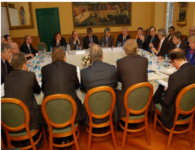
The participants of the Vilnius meeting