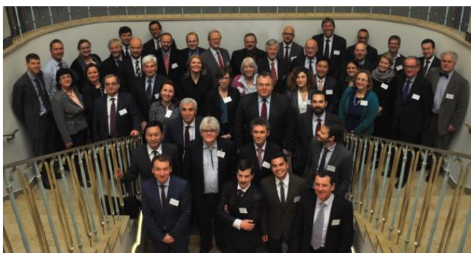
The participants of the 2 nd Meeting of the OSCE Network in Hamburg

The 2 nd Network meeting took place in Hamburg on 24 February 2016. It was attended by representatives of 40 of the 54 Network member institutions, the German Federal Foreign Office, the OSCE Documentation Centre and the OSCE Secretariat.