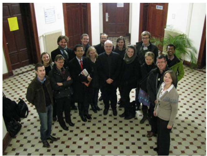
The participants of the conference at IFSH

After 9/11 state actors in different parts of the world and to various degrees decided to give security and counterterrorism measures priority over human rights and fundamental freedoms. In order to legitimize their policy choices, governmental actors argued that these "exceptional" measures are necessary to ensure security.