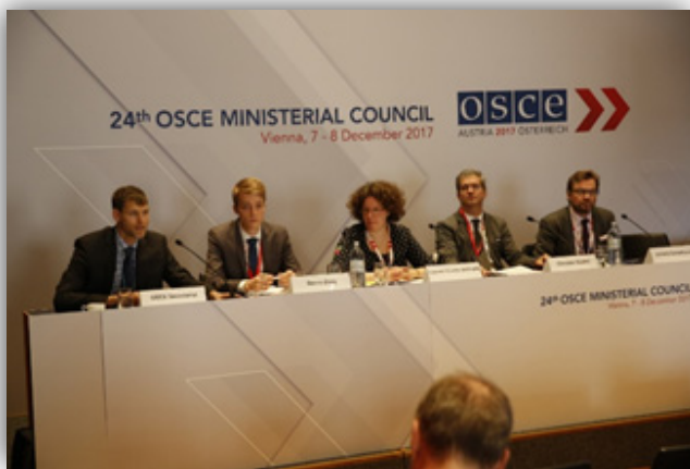
Panel at the Side-event of the 24th OSCE Ministerial Meeting