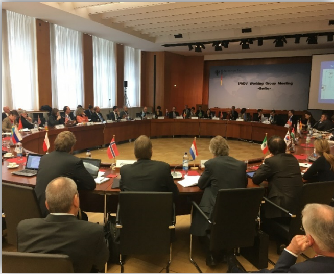
The participants in the IPNDV Conference