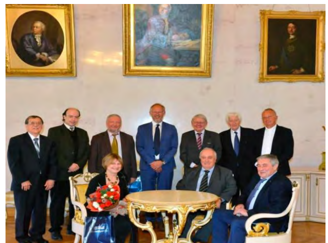
The Pugwash-Group in the Russian Academy of Sciences, Moscow