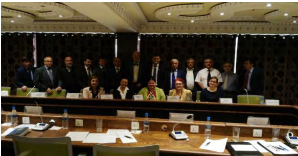
The participants in the round table in Dushanbe

Preventing religious radicalization is a highly sensitive issue at the top of the political agenda in Tajikistan. CORE and the Center for Islamic Studies, under the President of Tajikistan, invited about 20 governmental officials, scientists and NGO representatives to a joint brainstorming meeting on this subject. The current renaissance of Islam in Tajikistan is a strong element of state-building and the development of country's national identity. At the same time, as in the neighboring countries, Tajikistan's Muslim religious communities see themselves in an intense competition with other Islamic schools over of Islam's correct contemporary interpretation. Religious issues also play a dominant role in discussions about domestic and national security interests in Tajikistan, particularly in the context of the prevention of radicalization.