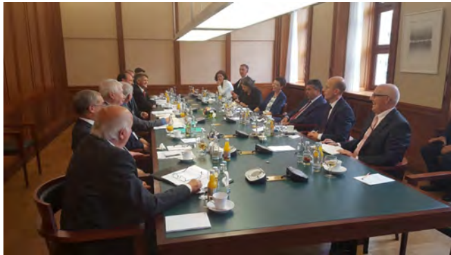
Roundtable with Foreign Minister Sigmar Gabriel and members of the Deep Cuts Commission

On 16. August 2017, the Deep Cuts Commission, initiated and coordinated by IFSH, had the opportunity to present its results to Foreign Minister Sigmar Gabriel and his team in a discussion at the Federal Foreign Office. The Deep Cuts Commission, founded in 2013, consists of 21 experts from Russia, the United States and Germany and has prepared and published three comprehensive reports as well as diverse working papers on strategic arms control, disarmament and non-proliferation (< www.deepcuts.org >). The focal points of the project, which is supported by the Federal Foreign Office and the Free and Hanseatic City of Hamburg, are the future of strategic stability in view of new military-technical developments, such as missile defense, the continuance of the INF Treaty and the further development of conventional arms control. The results have been presented and discussed internationally in various working meetings and panel discussions in Hamburg, Berlin, Moscow, Washington D.C., Vienna and New York.