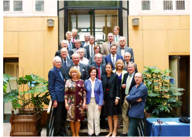
The participants of the Paris workshop

On 4-5 September 2017, 25 members of the OSCE Network of Think Tanks and Academic Institutions met in Paris with historians and retired diplomats to discuss the negotiations that led to the CSCE Charter of Paris (1990). The aim was to identify the various