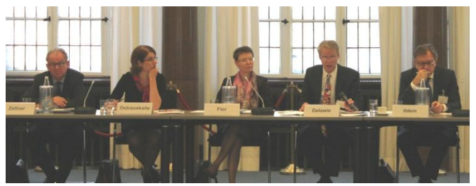
Participants of the International Arms Control Workshop in Berlin

together more than 80 government officials and Track-II experts from 25 countries as well as international organizations' representatives.