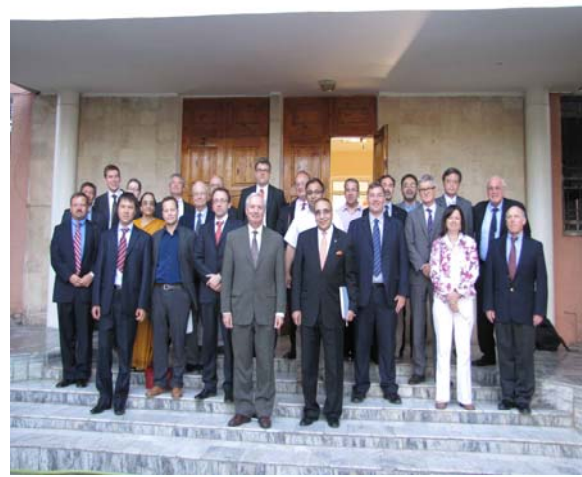
The participants of the conference in front of the OSCE Academy

NGOs and external actors like EU and OSCE there is an apparent lack of reliable security structures.