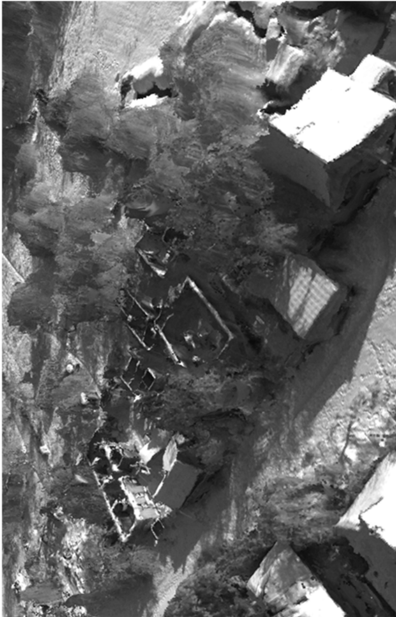
Figure 1. (C) Images converted to 3D rendering of war-damaged dwellings.