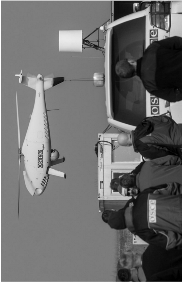
Figure 1. (A) The long-range UAV used by the SMM, both an electro-optical (visible light) and an infrared (thermal) camera in the pod (undercarriage ball). 31